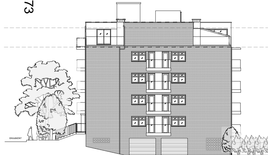
EXISTING APARTMENT SIDE ELEVATION 1:100 @ A1