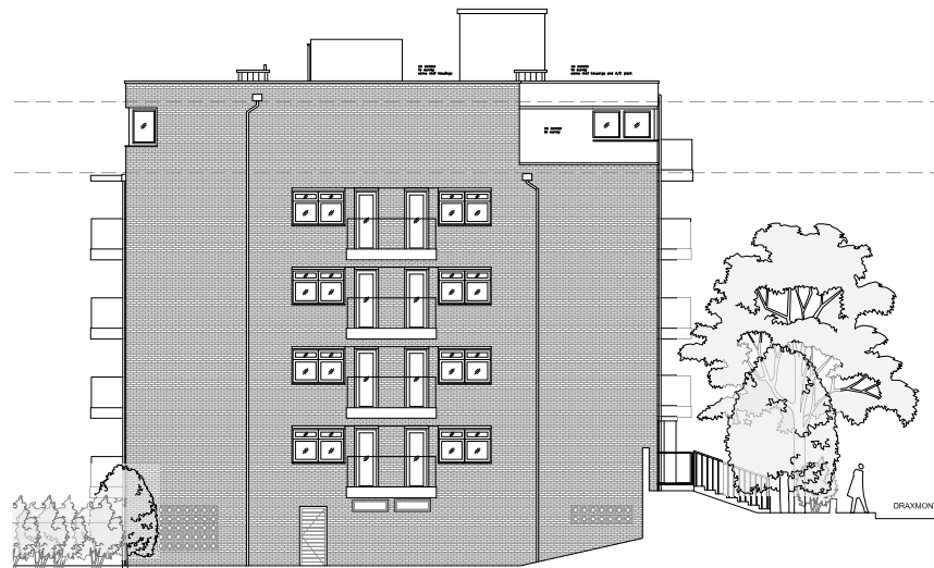
EXISTING APARTMENT SIDE ELEVATION 1:100 @ A1